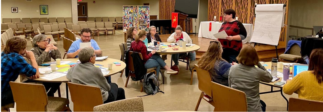
A snapshot of our fall retreat in action!

Sometimes recently single people are restless to find a new partner, and sometimes congregations rush to get a new pastor. In both cases, trustworthy friends wisely encourage: Slow down. Take some time to deal with past issues. Get to know who you are and what you need. Thanks be to God that our Transition Team has chosen to prioritize healing and reflection. As we discern who we are and who we are called to be for ourselves and our neighbors, it will become increasingly clear what kind of leader we will need to call as our next pastor.